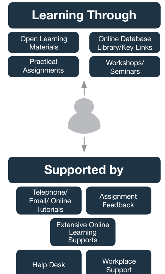
The OTC Supported Open Learning Model